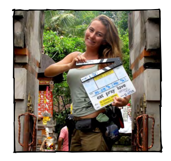
Working as an AD on Eat Pray Love filmed in the Balinese village Alison grew up in.