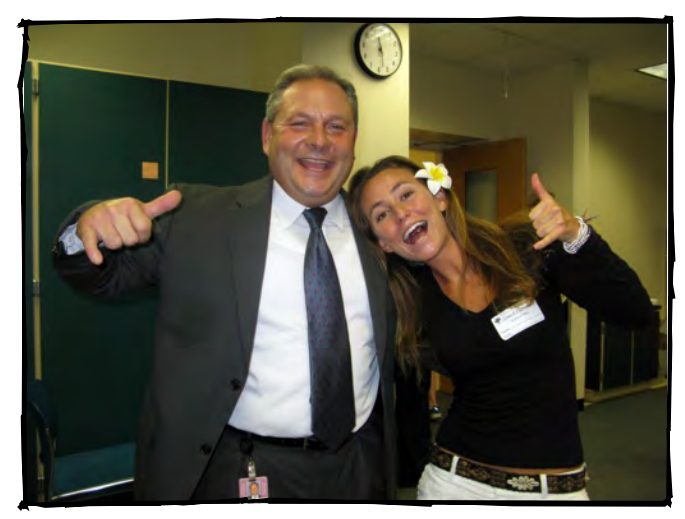
Head of school district

(Lower Merion School District recognized for excellence by the Commonwealth & National Blue Ribbon Award for Excellence in Education)